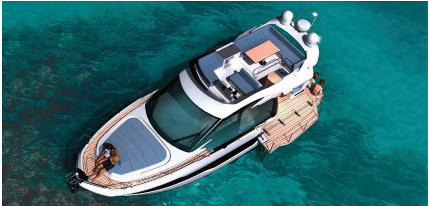
Put down the sides and extend the amount of space in the cockpit - genius!