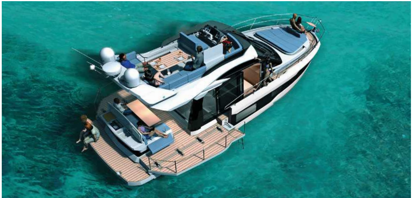
Cockpit seating can be turned into a sundeck

The large flybridge is the centre of attention